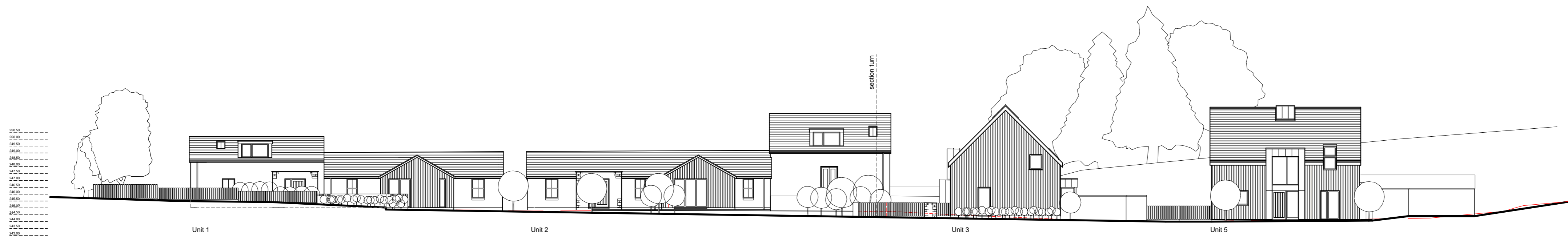
01 SECTION A-A 1/200

See Site Plan for locations of sections (drg ref 1730-PL01)